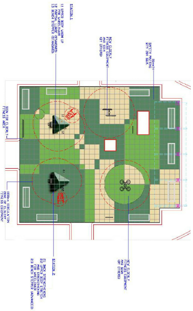
D ELDERLY FITNESS STATION (OPTION III) BLOW-UP PLAN SCALE 1:200

NOTE: *CONTRACTOR TO LOCATE EXPANSION JUNT @ MAX. 15 PER LINEAR METRE & TO BE APPROVED BY ARCHITECT / STRUCTURAL ENGR. *ALL SCREENING, WATERPROOFING, STRUCTURAL SLAB SHOULD REFER TO DRAWING'S STRUCTURAL ENGR. SPECS. / ALL DRAINAGE POINTS CALCULATIONS & EXACT LOCATIONS OF SUB-SOIL DRAINS SHOULD REFER TO DRAINAGE CONSULTANT'S DRAWINGS. *PAVING SOIL & PAVING MATERIALS INCLUDING PROPER PART DRAINAGE INCLUDING PROPER PART DRAINAGE SHOULD BE LED BY SOFT LANDSCAPE SUB-CONTRACTOR. *THE CONTRACTOR IS REQUIRED TO COORDINATE ESPECIALLY THE LEVELS AMONG SOIL SURFACES, DRAINAGE INSPECTION CHAMBERS, PAVING'S PLANTING AREA, AND LANDSCAPE SUB-CONTRACTOR TO PROVIDE SHOP DRAWINGS, FINISH DETAILS AND LEVEL SURFACES AND STRUCTURAL CUTTING OF STONE FOR PLANTER KEBB COPING SHOULD BE IN RESERVAE AND TO FOLLOW THE CURVILINEAR PROFILES.