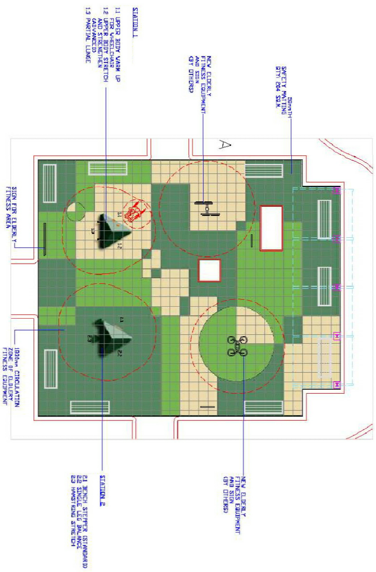
C ELDERLY FITNESS STATION (OPTION II) BLOW-UP PLAN SCALE 1:200